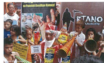
"Ang magandang regalo ngayong Pasko ay ligtas at malusog ang bawat Pilipino"

There were 57 (93%) hospitals with reports submitted (Table 3).