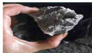
Photo of kalbuuro, a fruit ripening agent used as improvised firework.

There were 51 (84%) hospitals with reports submitted (Table 3). Three sentinel hospitals had cases. Ten (16%) did not submit a report (Table 4).