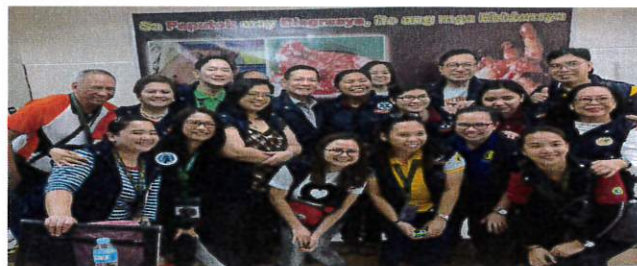
Press Conference on Fireworks-related Injuries with Secretary Francisco T. Duque III and USec. Gerardo V. Bayugo

There were 59 (97%) hospitals with reports submitted (Table 4). Thirty-nine sentinel hospitals had new cases. Two (3%) did not submit a report (Table 5).