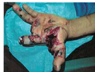
Lahat ng paputok ay nakakadisgrasya. Iwasan ang paputok.

There were eight (13%) hospitals with new reported cases and 49 (82%) sentinel hospitals who submitted “no case” reports or had zero case upon monitoring by KMITS and RESU staff. Three (5%) did not submit “no case” report to ONEISS and cannot be reached for further verification (Table 5).