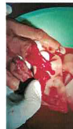
Degloved 3rd finger sustained from an unknown firework

There were 13 (22%) hospitals with new reported cases and 41 (68%) sentinel hospitals who submitted "no case" reports or had zero case upon monitoring by KMITS and RESU staff. Six (10%) did not submit "no case" report to ONEISS and cannot be reached for further verification (Table 5).