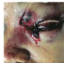
Ruptured globe, left eye due to "Missile" firecracker

There were 12 (20%) hospitals with new reported cases and 47 (78%) sentinel hospitals who submitted "no case" reports or had zero case upon monitoring by KMITS and RESU staff. One (2%) did not submit "no case" report to ONEISS and cannot be reached for further verification (Table 5).