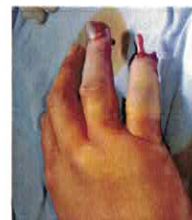
Disarticulated 5 th digit, right hand due to Pia-Pla

There were 15 (25%) hospitals with new reported cases and 36 (60%) sentinel hospitals who submitted "no case" reports or had zero case upon monitoring by KMITS and RESU staff. Nine (15%) did not submit "no case" report to ONEISS and cannot be reached for further verification (Table 5).